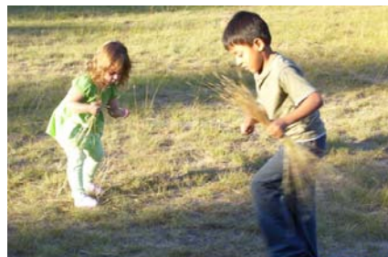
Nature, God's second textbook