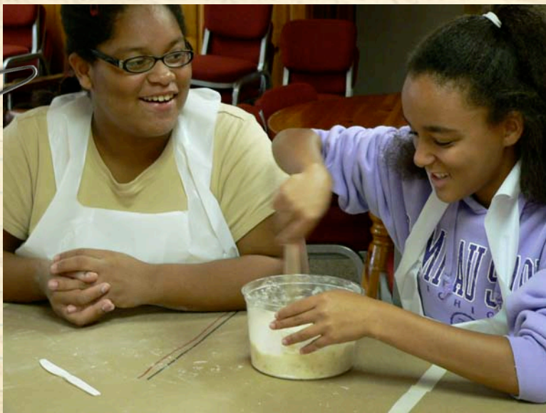
Active projects are a part of helping young people to learn and explore.