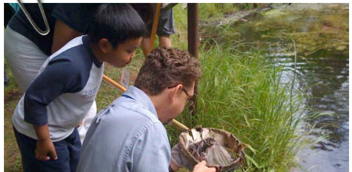
Science: Exploring nature

To participate in the program or to get more information, please contact your local Adventist Church School or contact us directly. Space is limited so please see the opposite side for the deadline information.